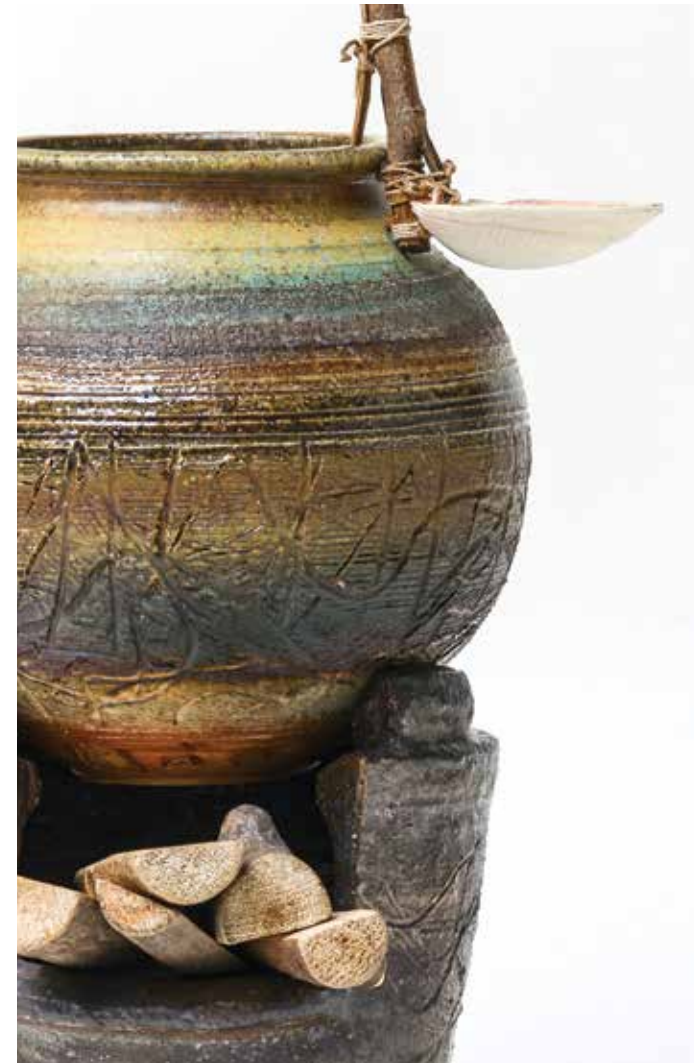
Over a Fire, 2018 Stove - Mixed Raku Clay Cooking Pot - Stoneware White Clay H 32 x 20 x 20 cm