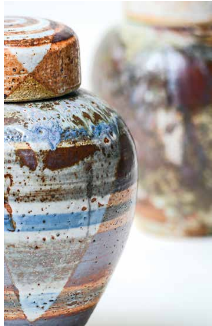
Preserve Series, 2018 White Raku H 23.26 x Ø 16.20 cm