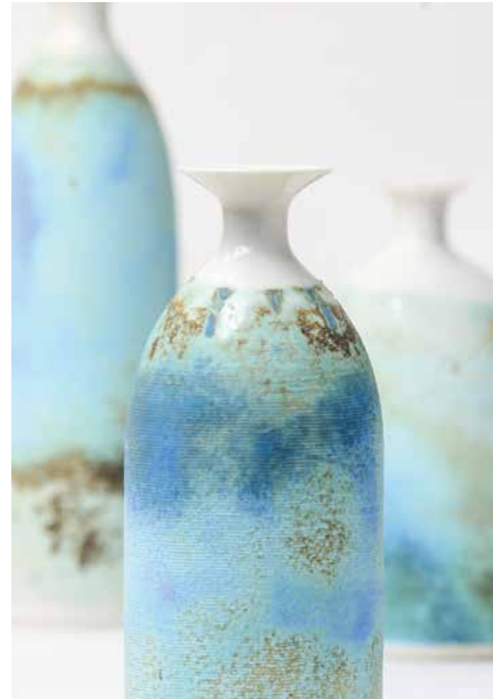
Message in a Bottle series, 2018 Porcelain (L-R) H 30 x Ø 9 cm. H 21 x Ø 9 cm. H 10.2 x Ø 12.5 cm