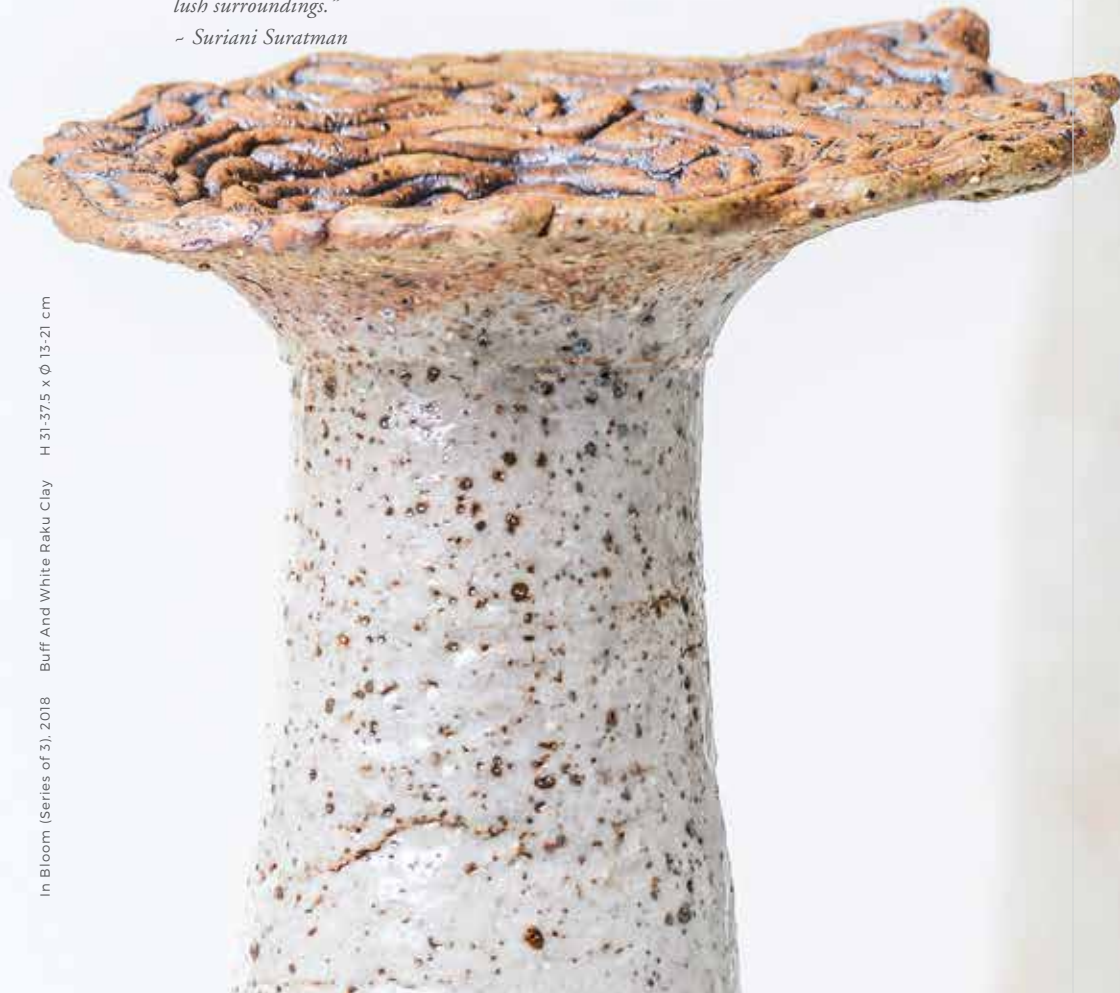
In Bloom (Series of 3), 2018 Buff And White Raku Clay H 31-37.5 x Ø 13-21 cm