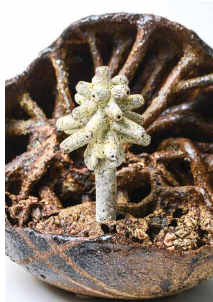
Tailpot Palm Tree - What will we leave behind? 2018 Mixed Stoneware (Raku clay), Singapore Local clay slip H 21 x 25 x 22 cm