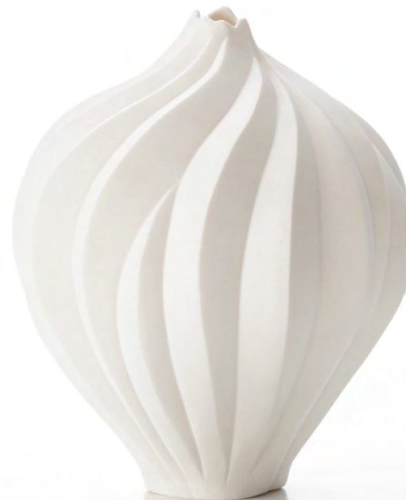
NAMI TAKAHASHI (b. 1973)

Fruit 0024 2017 Porcelain H 17.6 x 14.7 x 13 cm