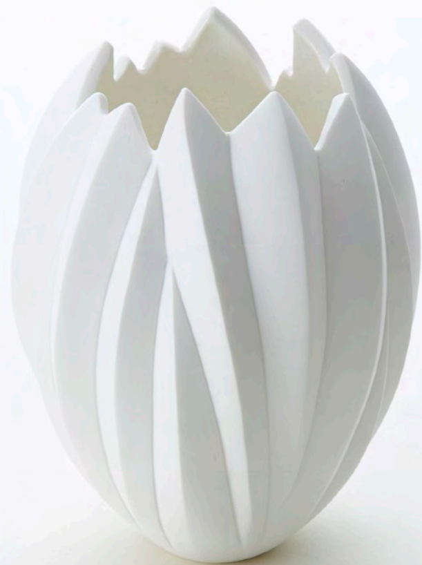
NAMI TAKAHASHI (b. 1973)

Fruit 0024 2017 Porcelain H 17.6 x 14.7 x 13 cm