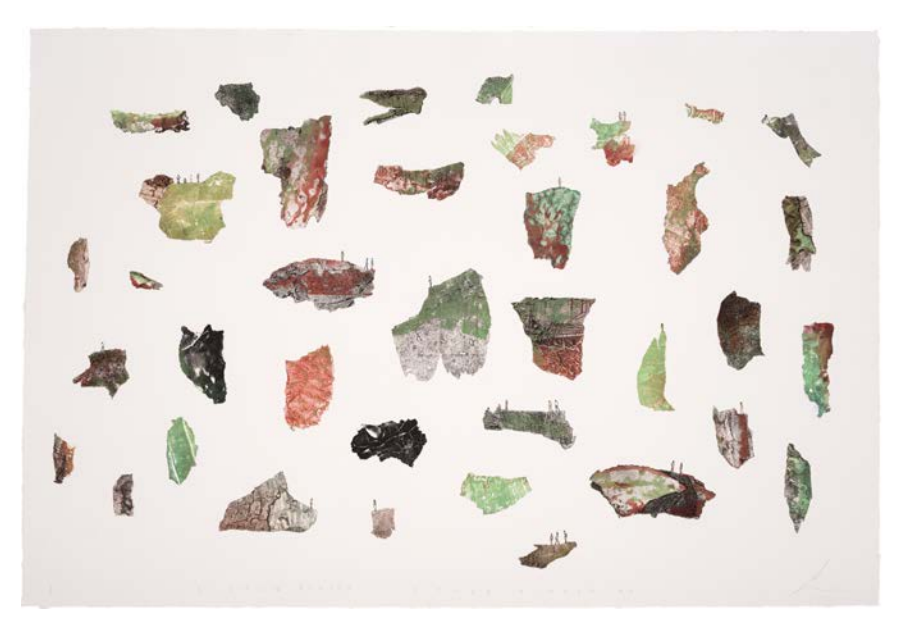
Little People, Little Places (Lush), 2021

Collagraph and Screen Print on Paper H 70 x 104 cm