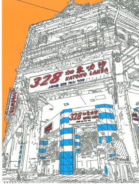
328 Katong Laksa(?) 2021

Linocut Print on Awagami Bamboo Select Paper H 52 x 43 cm Unique Ed 1/1